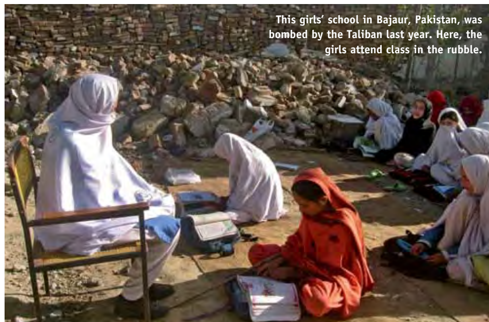
This girls' school in Bajaur, Pakistan, was bombed by the Taliban last year. Here, the girls attend class in the rubble.